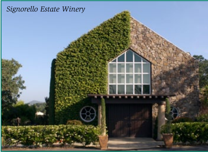
Signorello Estate Winery

Burgundian. He strives for lush fruit to produce rich Chardonnays, like those of Domaine Coche-Dury and Domaine Leflaive. And he focuses on elegance, balance and depth when producing magnificent Pinot Noir wines, like those from Domaine de la Romanee-Conti and Domaine Leroy.