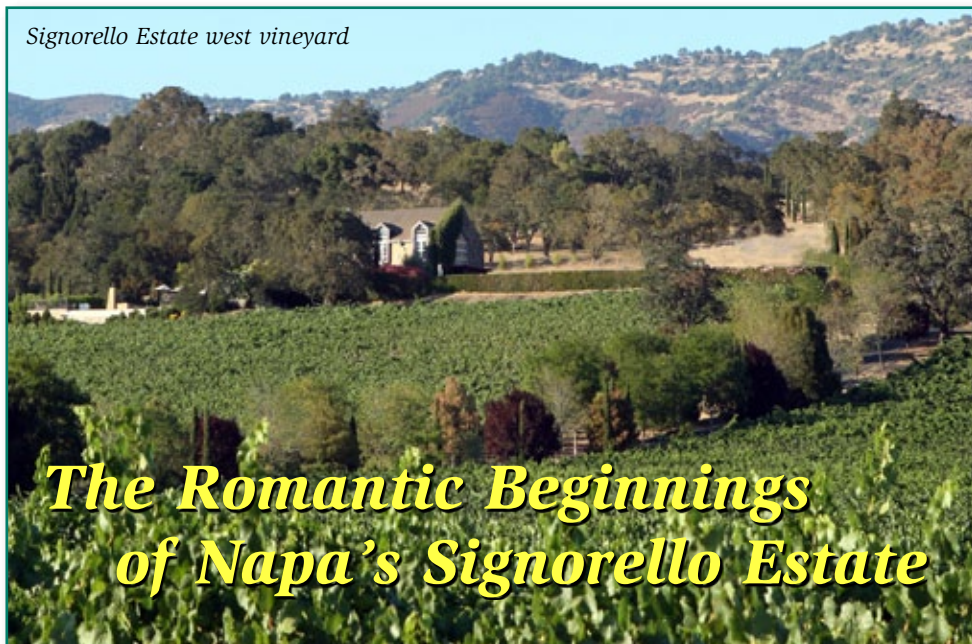
Signorello Estate west vineyard

To learn more about this Club, call 800-823-5527 or visit www.Vinese.com